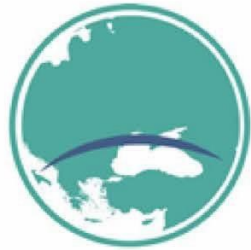
CPMR BALKAN & BLACK SEA COMMISSION